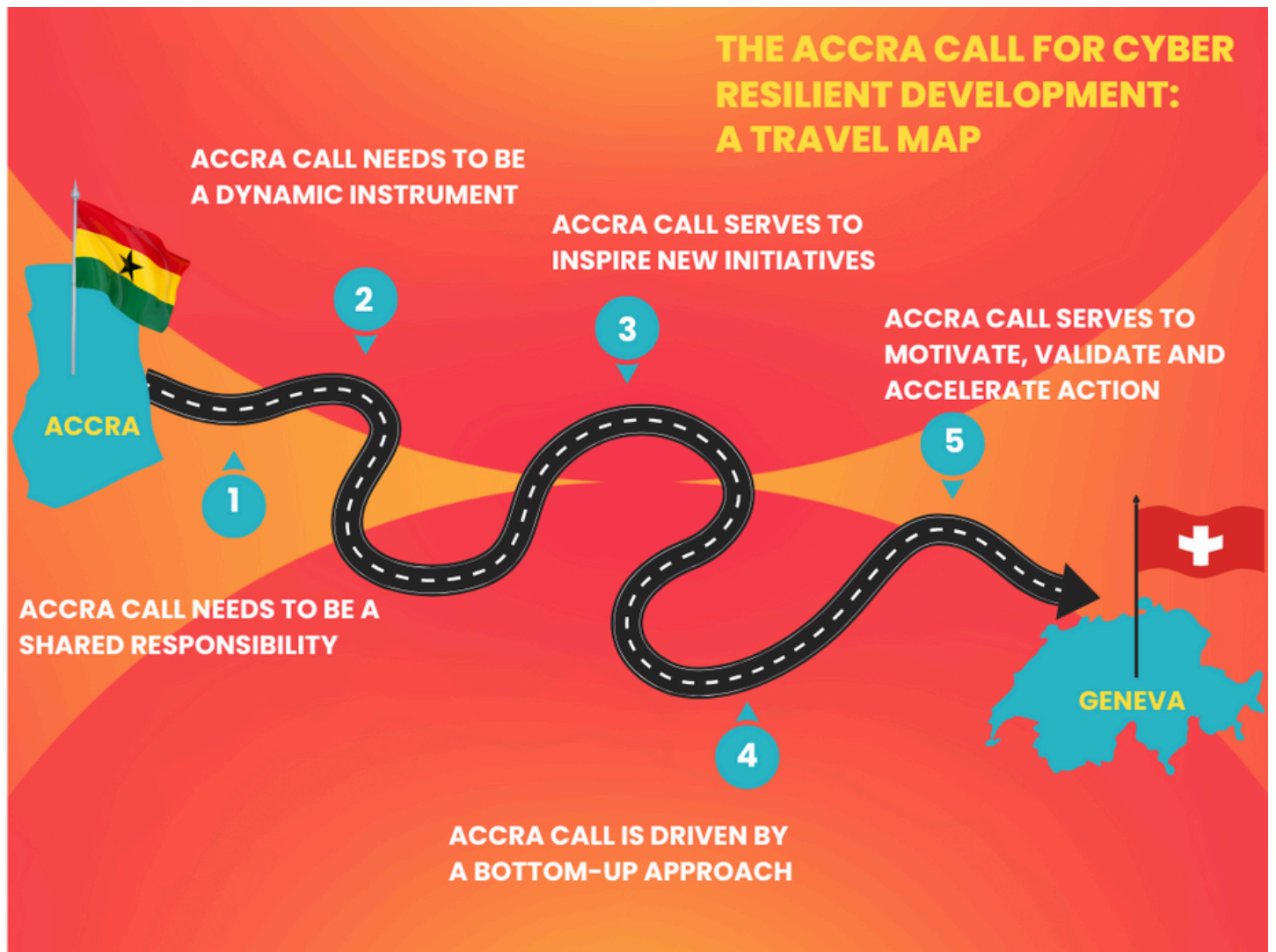
Figure 2. The Accra Call for Cyber Resilient Development: A Travel Map